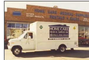
In 1974, Home Care Medical Supplies started out with just two employees and one delivery truck.

At the time there really was no blueprint to follow for home medical service providers and Home Care Medical began to pave the way with services like home delivery and set-up of IV drugs. Enteral therapy was