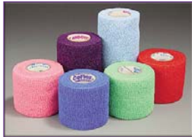
Stabilize It. Athletic tape provides extra stability for athlete's elbows, knees, ankles and other joints.

An array of products designed to aid the professional athlete, semi-professional athlete, student athlete, people who are trying to get in and stay in shape as well as people with athletic-related injuries, are on display at