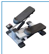
This step climber is just one of the many "stay healthy" products on display.

Home Care Medical's "try before you buy" pledge lets customers experience items like reclining lift chairs, scooters, walkers and more to feel even more sure about the items they will be purchasing.