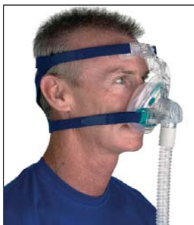
The importance of a proper fit of a CPAP mask cannot be over emphasized. A comfortable and precise fit is necessary for both compliance to the prescribed equipment and the effectiveness of the therapy.