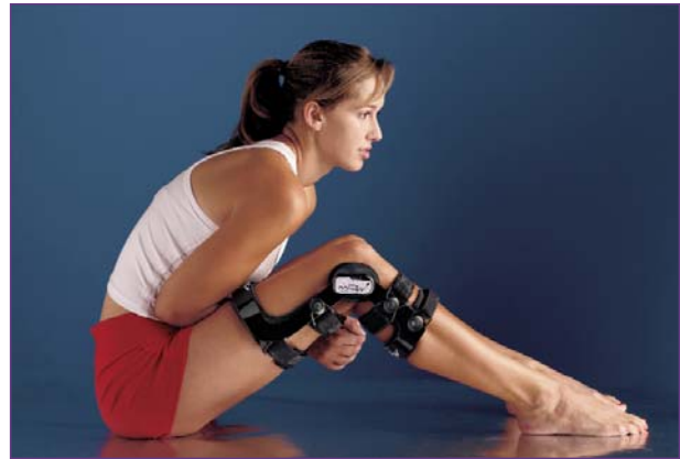
A variety of products designed to support injured or strained muscles are available at Home Care Medical. Professional fitters are on staff to help with your product selection.

Braces are generally used following knee surgery, reconstruction of the ACL (anterior cruciate ligament) or PCL (posterior cruciate ligament) or to prevent or support a torn ligament.