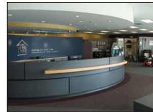
Located just south of Layton Avenue, between 74th and 76th Streets off of Barnard - Home Care Medical's 8,000 plus square foot retail store displays products in real-life settings.

started shortly after to serve patients in need of this medical service.