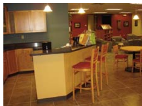
Horizon Grief Resource Center kitchen and dining area are open to guests.