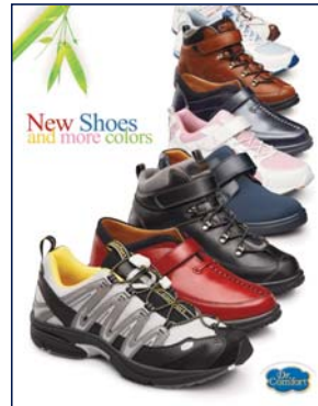
Dr. Comfort shoes aren't just for diabetics. These shoes are great for athletes and people who are on their feet all day.

Visit Home Care Medical's retail store at 4818 S. 76th Street, just one block south of Layton Avenue on Barnard between 74th and 76th Streets.