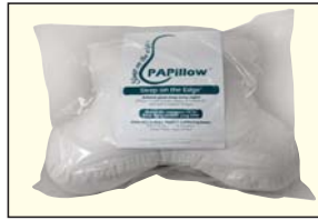
Special pillows are available to make sleeping with sleep apnea equipment more comfortable.

Home Care Medical's retail location is home to the Respiratory Care Center. Professional fitters help those diagnosed with sleep apnea to select the equipment that best fits their needs. By having the most comfortable and finely tuned equipment - compliance with the doctor-ordered therapy is much more likely.