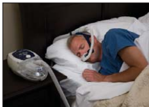
Obstructive sleep apnea is a treatable condition.

Sleep apnea involves the obstruction of the breathing airway during sleep. The disorder causes people to literally "stop breathing" for a period of time while sleeping.