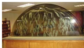
The Horizon Grief Resource Center monument.

The Horizon Grief Resource Center is a part of Horizon Home Care and Hospice and is available to anyone who is grieving the loss of a loved one.