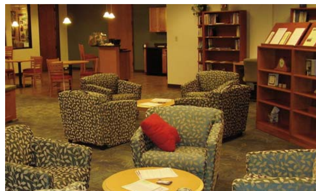
The Horizon Grief Resource Center opened on July 11, 2006. Horizon offered the first "walk-in" center in Wisconsin dedicated solely to help people through their grief and loss. The Horizon Grief Resource Center is located at 8949 N. Deerbrook Trail in Brown Deer, Wisconsin.