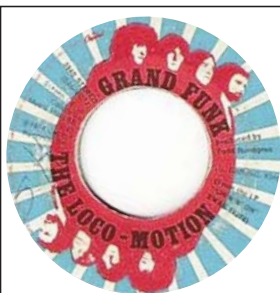
On the radio... May 15, 1974 - Billboard's Hot 100 number 1 single was "The Locomotion" by Grand Funk.

Professional and customer referrals had grown to a point that, by 1983, Home Care Medical was servicing most of southeastern Wisconsin, including Milwaukee's eight surrounding counties.